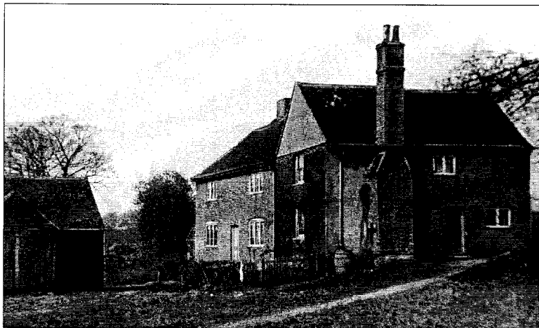
Breakspear Farm, Bedmond, c1910.