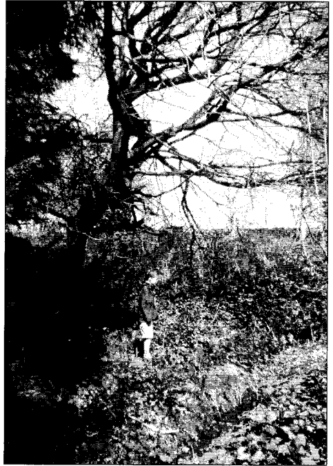
Possibly the same spring?

Earlier this year, members of the Abbots Langley Local History Society visited a Bedmond spring, anecdotally referred to as the “Holy Well”, with the kind permission of the landowner. Now on private property, this location was originally part of the land of Breakspear Farm which was the birthplace of Nicholas Breakspear. He was born in about 1100 and in 1154 became the only English-born Pope (Pope Adrian IV).