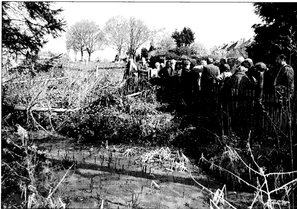
Members of ALLHS observe the pond fed by the spring.