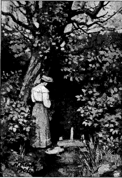
Holy well at Breakspear Farm. Painted by N. Trent RA, 1906.